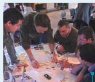
Delegates on the public realm course

The course developed by the Public Realm Information Network (PRIAN) on 'Design and Maintenance of the Public Realm' is backed by IHIE. The first two courses held in 2007 attracted the desired range of delegates – bringing urban designers, architects etc together with traffic engineers to develop a common understanding of each others' disciplines.