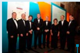
The Highways Award Judges

The Institute exhibited at Road Safety Expo, the three regional Roads Expos, JCT's September symposium and had a presence on the Highways stand at Traffex 2007.