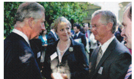
Steve Blackburn discusses the Ringway Trainee Highway Workers programme, winner of the IHE Employer of the Year 2009, with Prince Charles