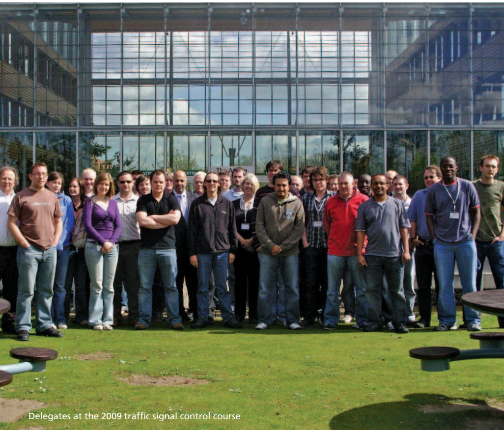
Delegates at the 2009 traffic signal control course