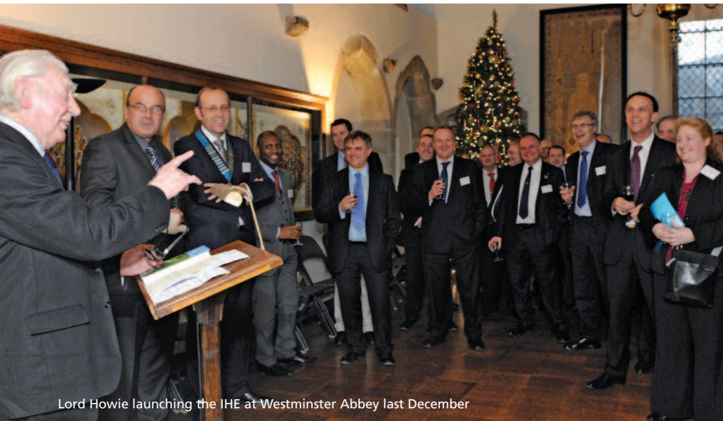
Lord Howie launching the IHE at Westminster Abbey last December

“The decision of the 2009 AGM to change the name of the Institute both to broaden its appeal and to recognise the changing nature of the Institute dominated the next twelve months’ activities. The December reception launching IHE at Westminster Abbey was a memorable occasion, made special by Evensong in the Abbey choir.