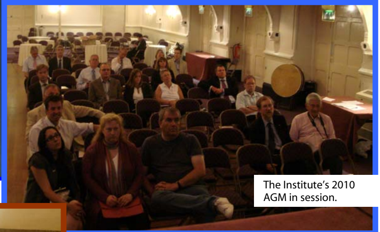
The Institute's 2010 AGM in session.